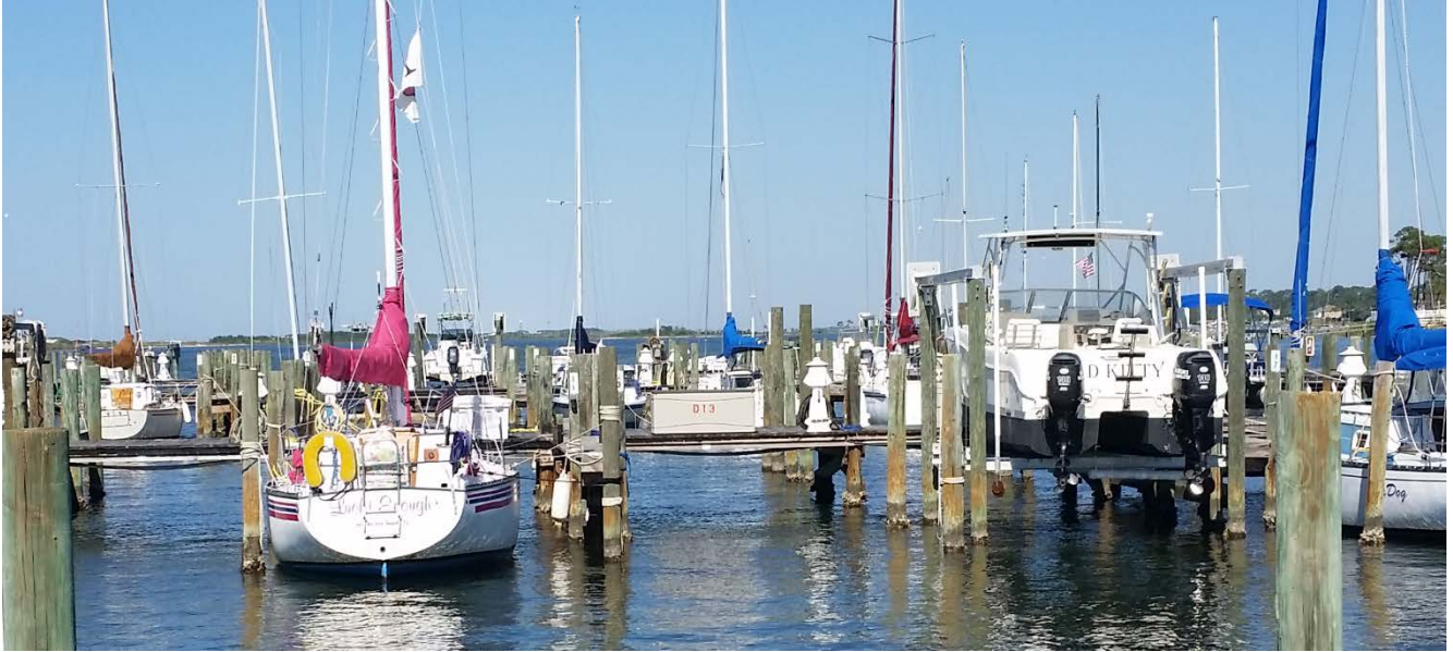
Slip viewed from front approach

We have a dock box with our slip number on it, the slip number is also painted on the outermost piling.